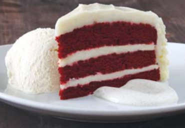
Red Velvet Cake