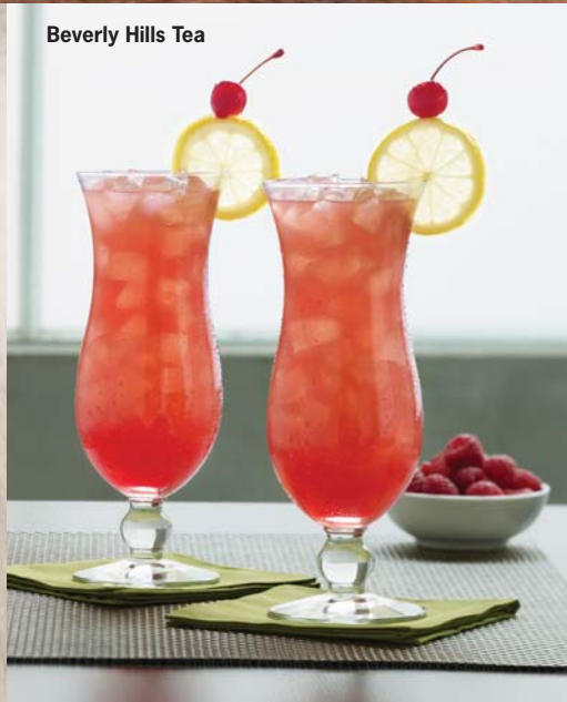
Beverly Hills Tea