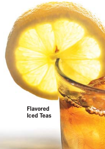
Flavored Iced Teas

Vanilla Strawberry Chocolate Oreo Avocado