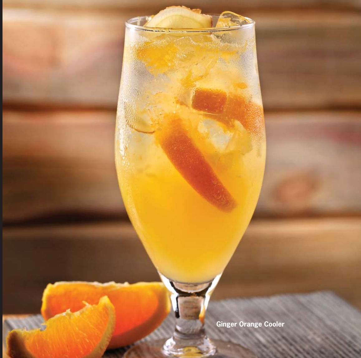
Ginger Orange Cooler