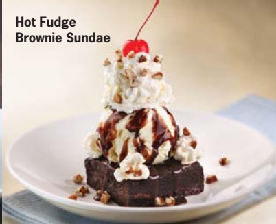
Hot Fudge Brownie Sundae