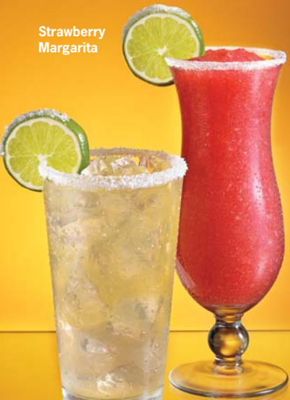
Cuervo Gold Margarita